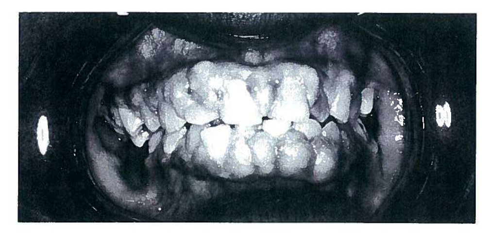
Figure 1. Gingival hyperplasia of 45-year-old African American woman medicated simultaneously with cyclosporin A and nifedipine.

The patient was diagnosed with gingival hyperplasia secondary to the medications, cyclosporin A and nifedipine. The treatment plan was a gingivectomy and gingivoplasty of both dental arches. Because the patient expressed extreme apprehension about the surgery, the gingivectomy was performed with the patient under sedation in the Ambulatory Surgical Unit (ASU) at Long Island College Hospital in Brooklyn, NY. A post-operative healing stent was used. The patient was taught proper home care techniques and was instructed to return for maintenance therapy every three